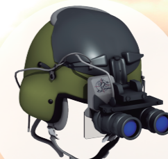
Helmet Mounted Sight

Exhaustive & Flexible: a deterrent and affordable weapon system